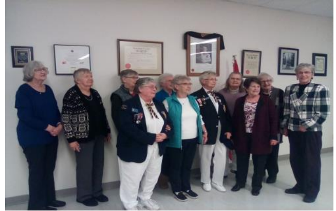
UCW Ladies who attended the Presentation of the Platinum Medal by the Nanton Legion.