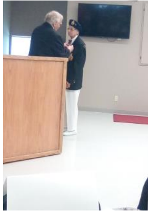
Presentation of Queen's Platinum Jubilee Medal